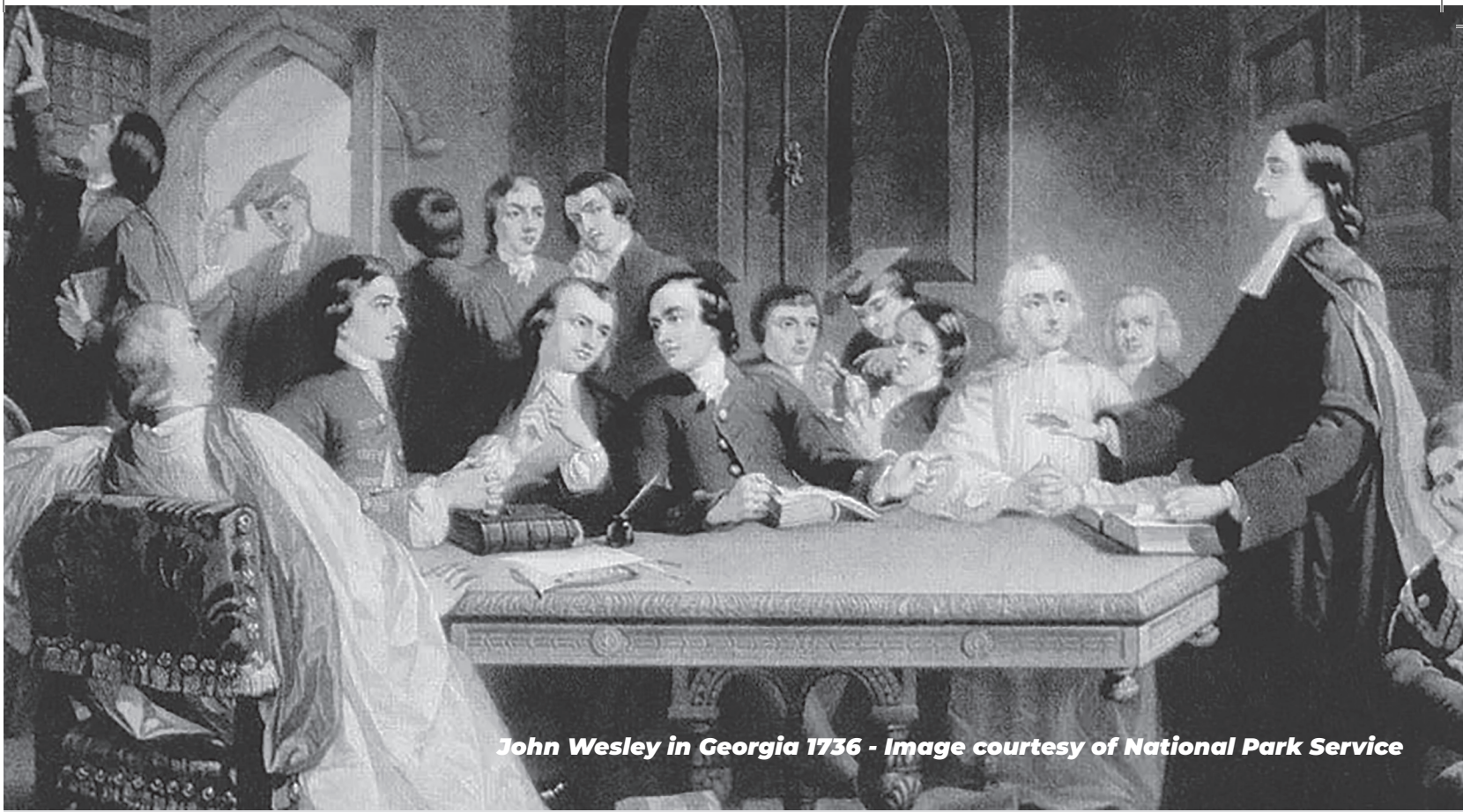
John Wesley in Georgia 1736